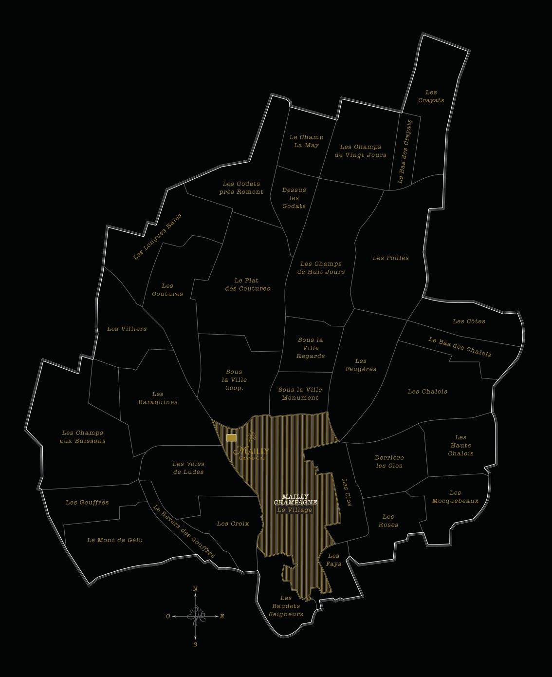
The 35 lieux-dits that make up the Mailly Champagne Grand Cru.